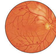
◀ Hypertensive retinopathy