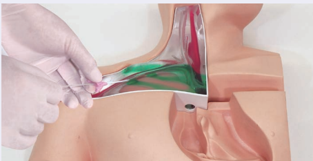
Transparent anatomical block