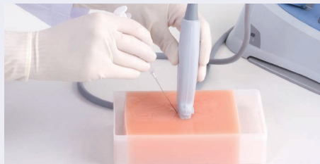
Ultrasound training block