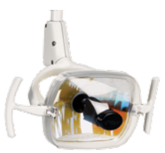
A-dec 500 Halogen

Place the assistant's clinical devices right where they are needed most. Adjustable 3- or 4-position holders are available as a chair mount, cuspidor mount or telescoping arm.