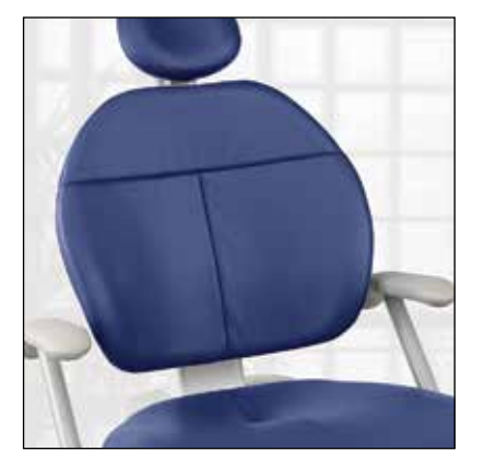
Sewn upholstery with armrests