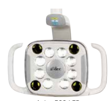
A-dec 500 LED