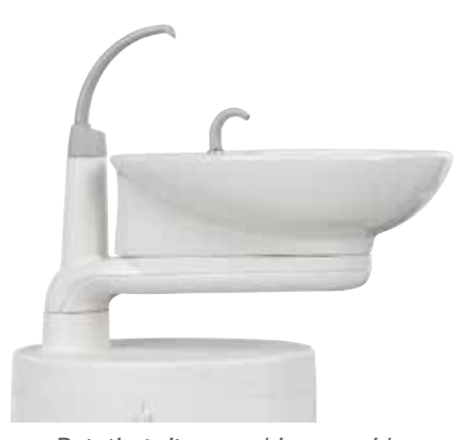
Rotating vitreous china cuspidor