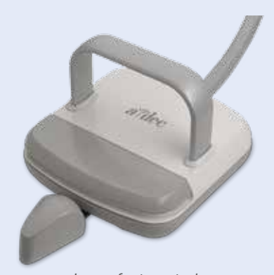
Lever foot control