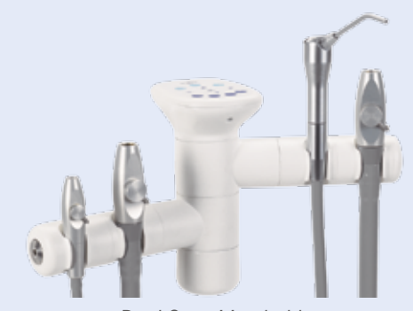
Dual 2-position holder