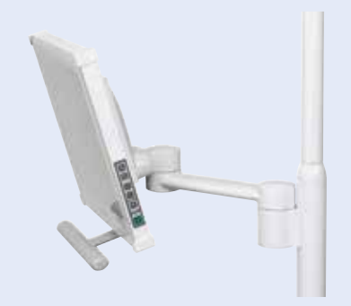
Light monitor mount with link arm