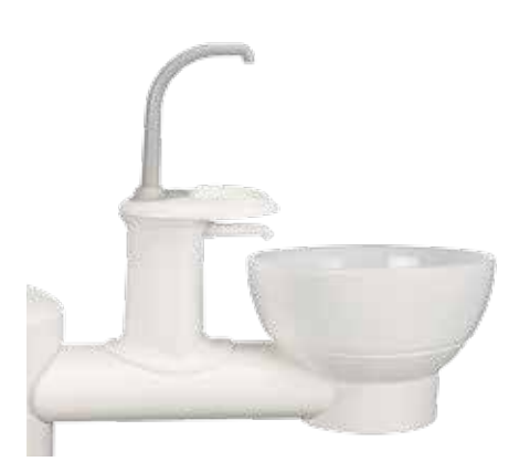
Fixed glass cuspidor