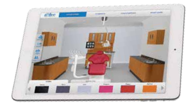
Order Your Samples at a-dec.com/InspireMe

Color makes all the difference in creating an environment that reflects you. That's why A-dec offers a wide variety of colors and selected options to coordinate seamless and sewn upholsteries.