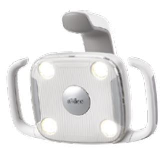
A-dec 300 LED