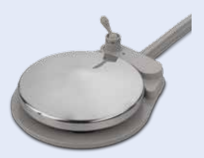
Disc foot control

Fingertip access simplifies chair adjustments and provides quick access to dental light and cuspidor control. Optional deluxe touchpad adds controls for integrated clinical devices such electric motors, cameras, and scalers.