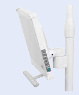
Light monitor mount