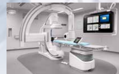
Azurion 7 B20/15