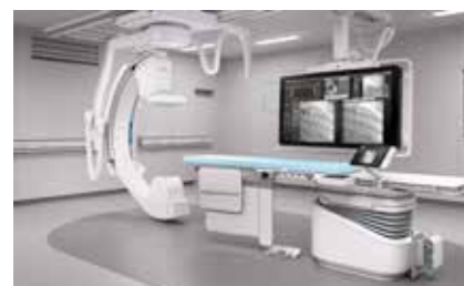
Azurion 7 C12

You can choose a system with either a 12" or a 20" Flat Detector to meet your application requirements. With its new 12" Flat Detector, the 7 Series provides high-resolution imaging over a large field-of-view with flexible projection capabilities, making it ideal for cardiac interventions. The entire coronary tree can be visualized in a single view with minimal table panning. Enhance visibility for diverse cardiac and vascular procedures with the excellent image quality and broad coverage of the next generation 20" Flat Detector. For a hybrid suite solution, the Azurion 7 the next generation 20" Flat Detector can be combined with the FlexMove option.