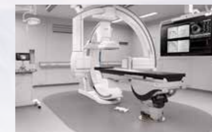
Azurion 7 B20/12 with OR table