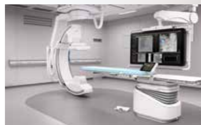
Azurion 7 C20