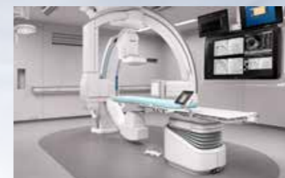
Azurion 7 B12/12

The Azurion 7 biplane is available in different configurations to support neuro, congenital heart, structural heart, electrophysiology and other complex cardiac and vascular interventions. The biplane system with two 12" Flat Detectors provides high-resolution imaging and positioning flexibility to reveal critical anatomical information during congenital heart and electrophysiology procedures. Enhance insight and certainty during neuro interventions with the perfect fit design that pairs a 20" frontal with a 15" lateral detector. The biplane system with a 20" and 12" Flat Detector provides exceptional clarity of detail and navigational precision to support a wide range of challenging cardiac and vascular interventions.