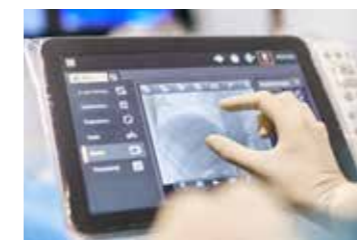
Touch screen module Pro

91% believe that the system will help reduce procedure time 1