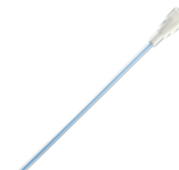
MAP600 Plastic Insertion Tool