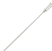
MAP550 Metal Insertion Tool