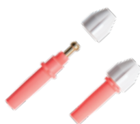
MAP500 Torque Device