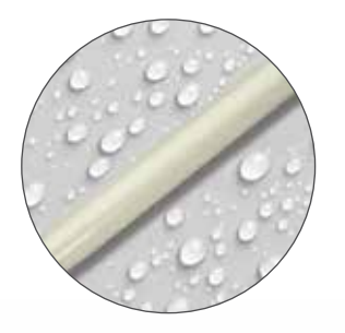
Advanced hydrophilic technology designed for optimal insertion and removal

A full suite of configurations and custom options