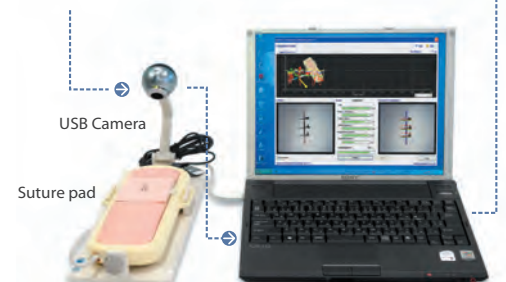
Skin suturing unit *PC is not included