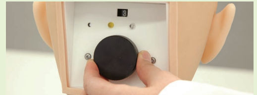
Quick switching between cases