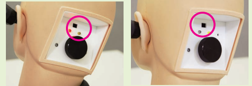
Alarm indicating painful insertion