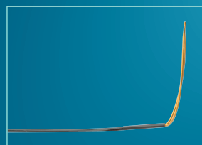
90°angle between Loop and Shaft

Increased biocompatibility Enhanced fracture resistance Excellent radiopacity Excellent shape supporting and distal shaft control ability